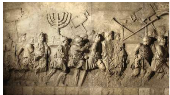
"The besieger spread his hand over all her delights." Romans carrying away the Temple vessels in their victory march, stone relief, Arch of Titus, Rome, 82 CE