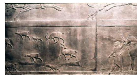
Hunting deer, relief at the Palace of Ashurbanipal, Nineveh, 645–635 BCE