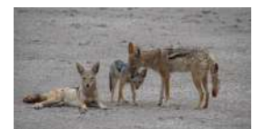
Female jackal and her offspring