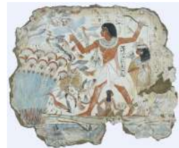
"My enemies hunted me like a bird." Hunting birds, relief, Tomb of Nebamun, Eighteenth Dynasty, Egypt

44 You have covered Yourself, as if with a cloud, so that no prayer can pass through, as though the gates of heaven are closed to our prayers. 74 The prophet speaks here in the name of all the people of Israel. 45 You render us 75 filth and refuse in the midst of the peoples. 46 All our enemies have opened their mouth wide against us, and we cannot respond. 47 Terror and a trap, or obstacles, 76 came upon us, desolation and disaster. 77 48 The prophet returns to speaking in first person singular: When faced with our shameful state among the nations, streams of water pour down from my eye, crying for the disaster of the daughter of my people. 49 My eye will flow with tears and will not cease, 78 from lack of respite. The tears do not cease because there is no respite from our troubles. 79 50 I cry continuously, until the Lord looks out and sees our misery from the heavens, and redeems us soon. Expressions of hope, loyalty, and faith in future salvation again come to the fore. 51 My eye distressed my soul, 80 or contaminated my soul, 81 more than all the daughters of my city. Alternatively: Jeremiah is lamenting over the fact that he has seen all of his neighbors and relatives going into exile or getting killed, while his own sobbing eyes are the only ones left to cry for all the rest, like an incompletely formed cluster of grapes [olelet] left on the vine during the harvest.