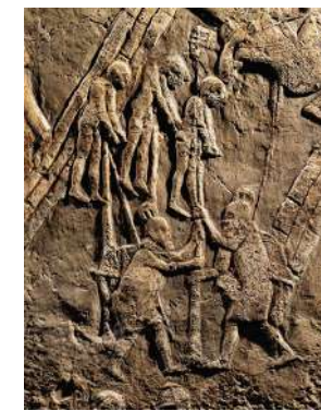
“Princes were hanged by their hand.” Men of Judah hanged, Lakhish reliefs, Nineveh, 701 BCE

The penultimate verse is repeated in a communal recitation: