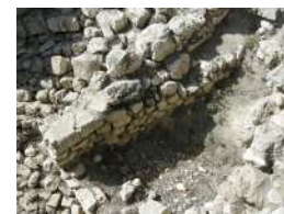
"He poured His fury like fire." Burnt room, City of David, Jerusalem, sixth century BCE