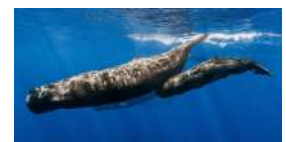
"Nurse their pups," female whale and her offspring