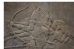
Arrows stretched for firing, relief at the Palace of Ashurbanipal, Nineveh, 645–635 BCE