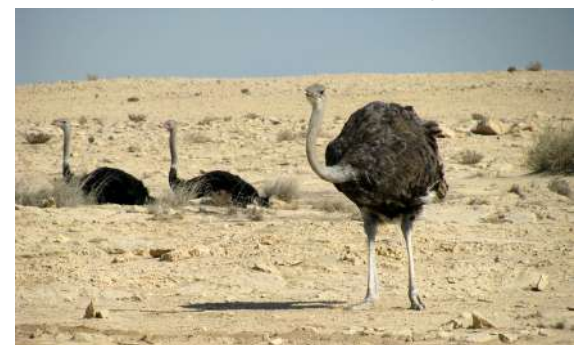
"Ostriches in the wilderness"