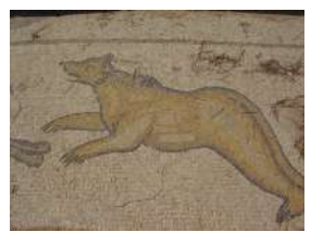
Bear, detail from the Birds Mosaic, Caesarea, Byzantine period