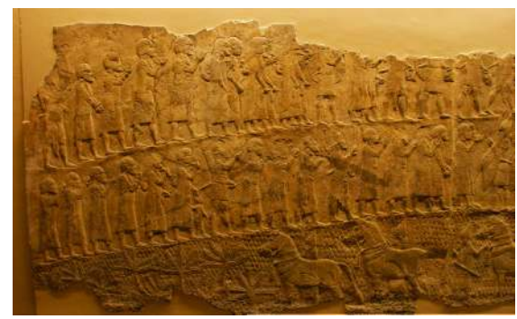
"My young women and young men have gone into captivity." Jews exiled from Lakhish, above left: men, above right: women; Lakhish reliefs, Nineveh, 701 BCE