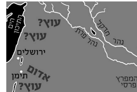
Possible locations for the land of Utz