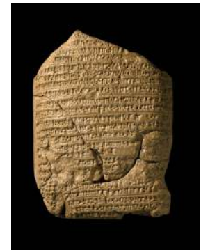
The conquest of Jerusalem described in "the Babylonian Chronicle," sixth century BCE