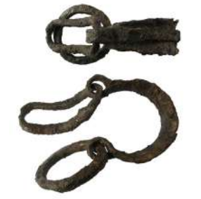
Remains of fetters, Roman period