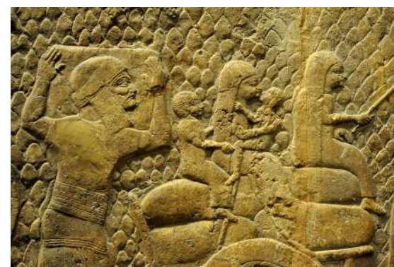
Men and women going into exile on a wagon, Lakhish reliefs, Nineveh, 701 BCE