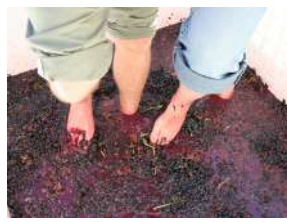
Treading in a winepress