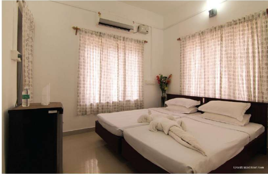
Kavaratti Island Resort Room

The only coral island of India is a group of 27 islands, 12 atolls, 3 reefs and 5 submerged sand banks with a total land area of 32 sq/km situated in the Arabian Sea. Lakshadweep gives us the best of all good things for a perfect holiday. Serene beaches, open road, warm welcoming people, decent resorts, adventure activities, safe and guided water sports, sun bathed shores and wonders in underwater. In Lakshadweep you can slip away from hustle and bustle of urban jungle and step into the cocoon of tranquility. It is only a hop away from Kochi and Bangalore by Air India flights or one may avail the ship services from Kochi.