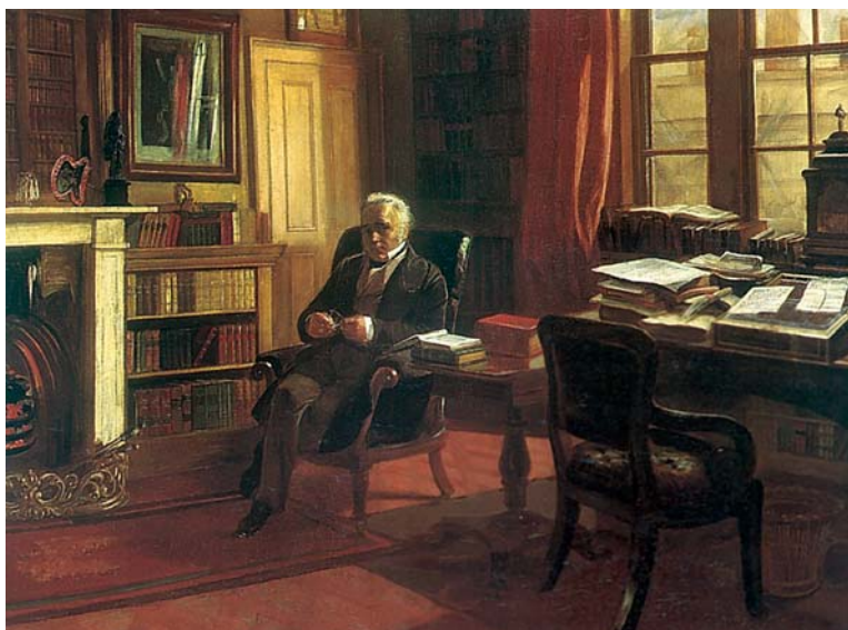
Fig. 4 – Thomas Babington Macaulay in his study