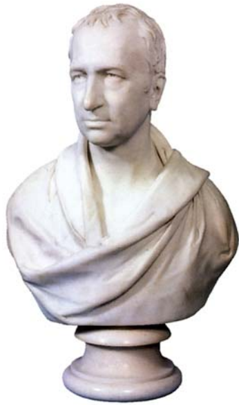
Fig. 2 – Henry Thomas Colebrooke

He was a scholar of Sanskrit and ancient sacred writings of Hinduism.