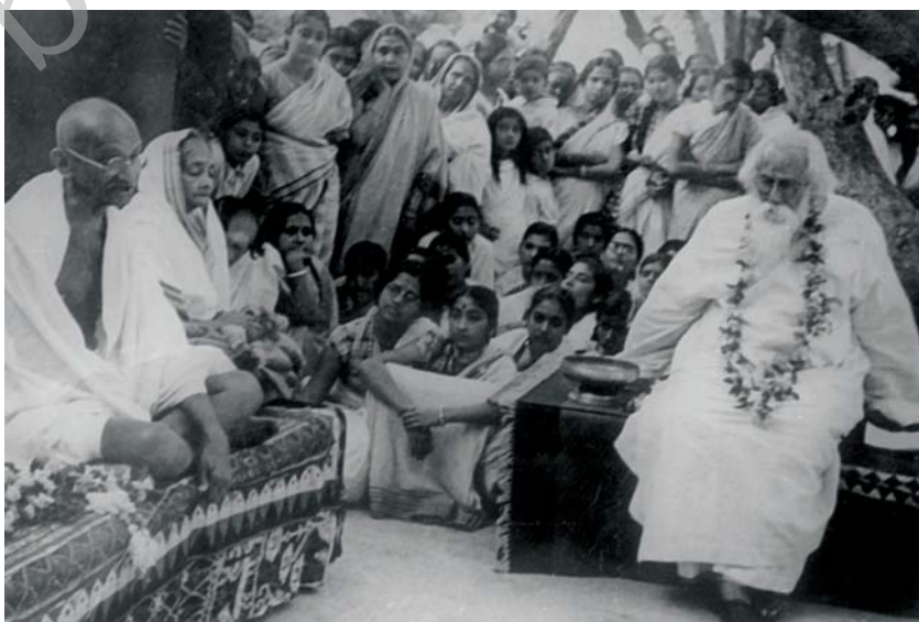
Fig. 9 – Mahatma Gandhi along with Kasturba Gandhi sitting with Rabindranath Tagore and a group of girls at Santiniketan, 1940

Western education, Mahatma Gandhi said, focused on reading and writing rather than oral knowledge; it valued textbooks rather than lived experience and practical knowledge. He argued that education ought to develop a person’s mind and soul. Literacy – or simply learning to read and write – by itself did not count as education. People had to work with their hands, learn a craft, and know how different things operated. This would develop their mind and their capacity to understand.