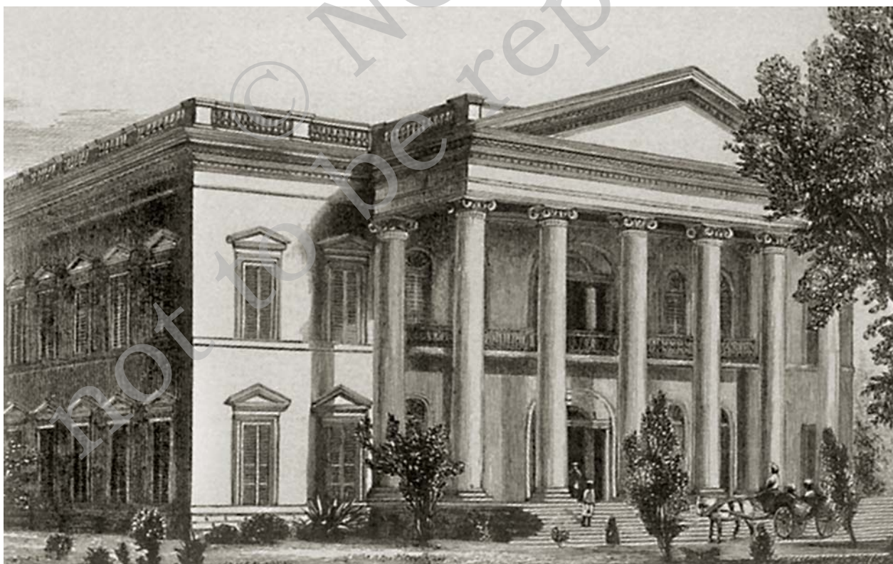
Fig. 7 – Serampore College on the banks of the river Hooghly near Calcutta

Over the nineteenth century, missionary schools were set up all over India. After 1857, however, the British government in India was reluctant to directly support missionary education. There was a feeling that any strong attack on local customs, practices, beliefs and religious ideas might enrage “native” opinion.