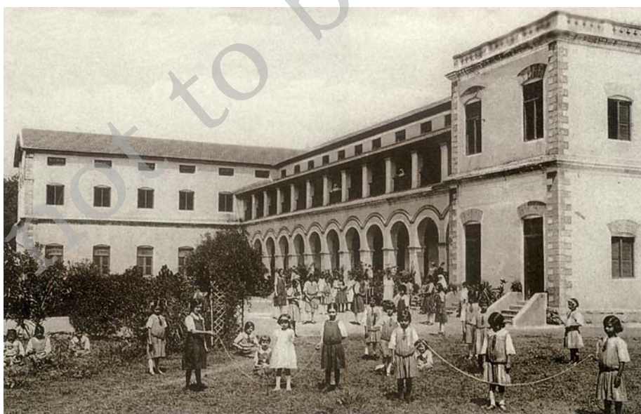
Fig. 11 – Children playing in a missionary school in Coimbatore, early twentieth century

Many individuals and thinkers were thus thinking about the way a national educational system could be fashioned. Some wanted changes within the system set up by the British, and felt that the system could be extended so as to include wider sections of people. Others urged that alternative systems be created so that people were educated into a culture that was truly national. Who was to define what was truly national? The debate about what this “national education” ought to be continued till after independence.