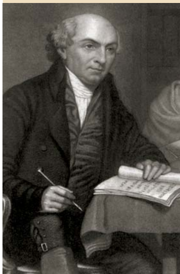
Fig. 6 – William Carey was a Scottish missionary who helped establish the Serampore Mission

The argument for practical education was strongly criticised by the Christian missionaries in India in the nineteenth century. The missionaries felt that education should attempt to improve the moral character of the people, and morality could be improved only through Christian education.