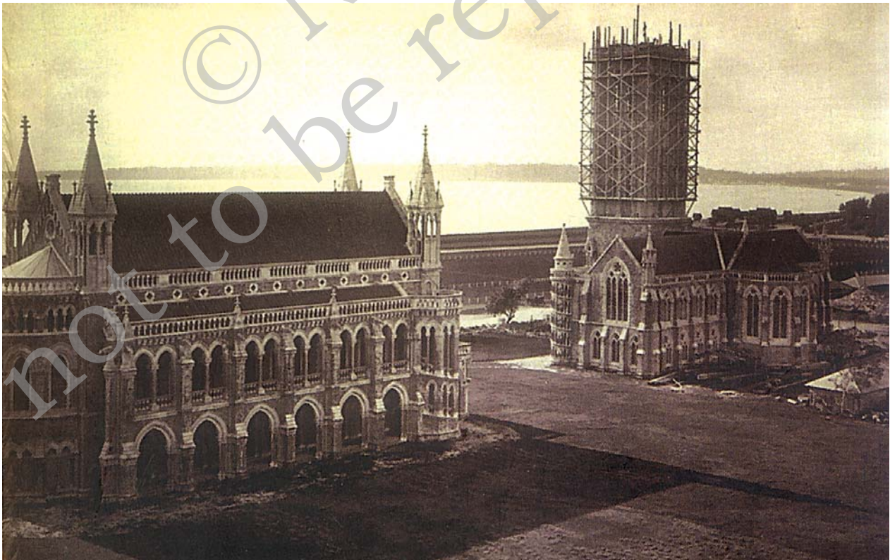
Fig. 5 – Bombay University in the nineteenth century

We must emphatically declare that the education which we desire to see extended in India is that which has for its object the diffusion of the improved arts, services, philosophy, and literature of Europe, in short, European knowledge.