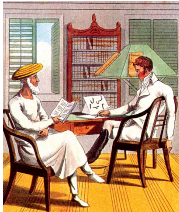
Fig. 1 – William Jones learning Persian

In 1783, a person named William Jones arrived in Calcutta. He had an appointment as a junior judge at the Supreme Court that the Company had set up. In addition to being an expert in law, Jones was a linguist . He had studied Greek and Latin at Oxford, knew French and English, had picked up Arabic from a friend, and had also learnt Persian. At Calcutta, he began spending many hours a day with pandits who taught him the subtleties of Sanskrit language, grammar and