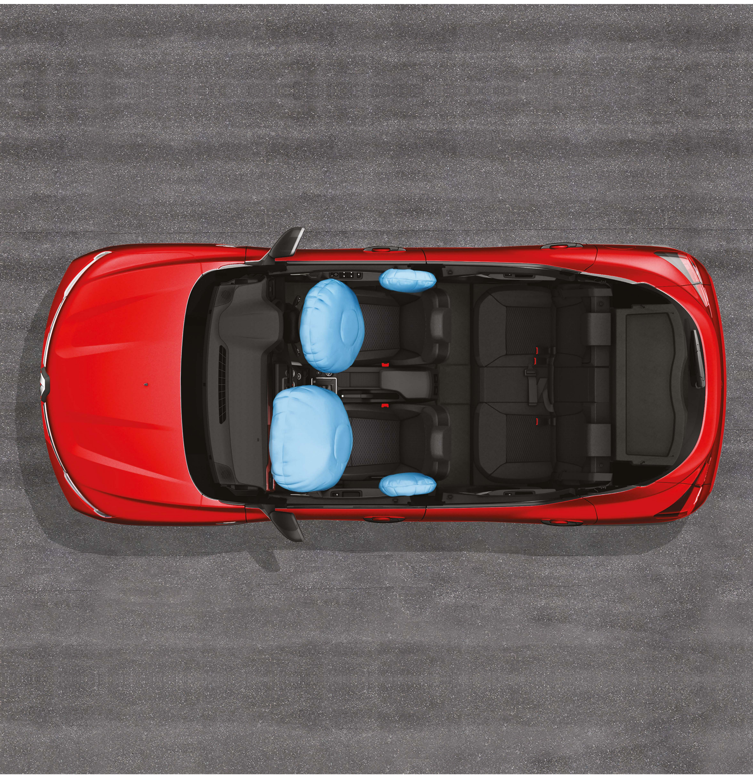
front airbag - driver & passenger

While you're out exploring the world, we'll keep you safe with 4 airbags and a variety of new, intelligent features such as electronic stability program (ESP), tyre pressure monitoring system (TPMS), traction control system (TCS) and hill start assist (HSA).