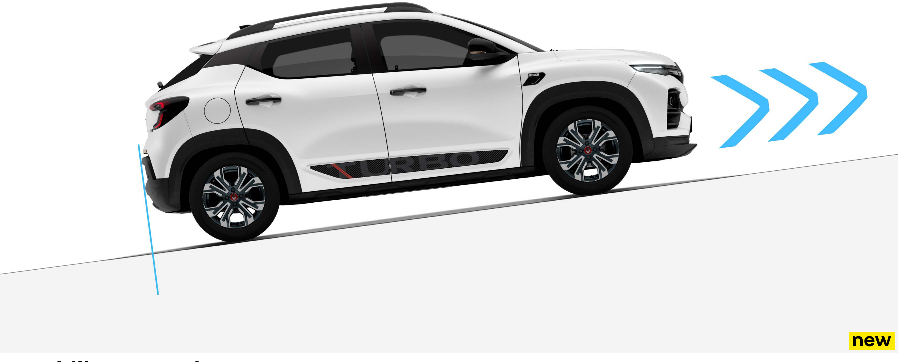
hill start assist

From preventing skidding to monitoring the tyre pressure in real-time, you can always trust your Kiger.