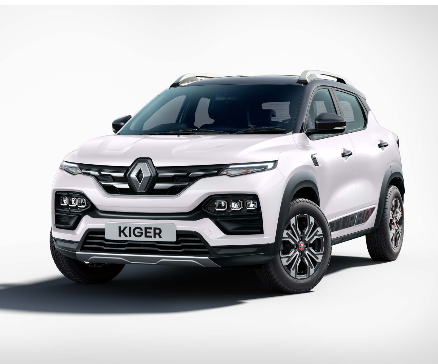
ice cool white