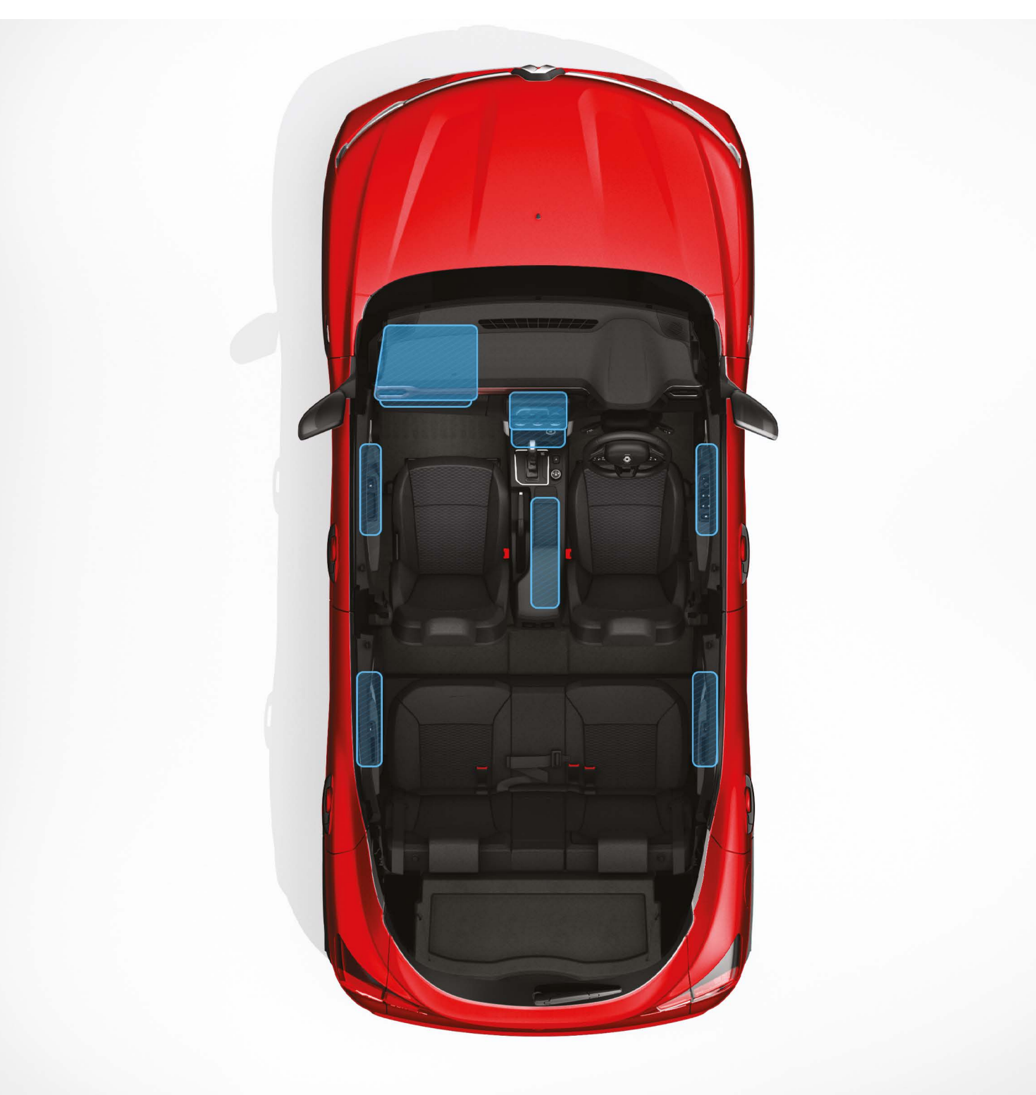
total cabin storage volume of 29 litres

Too much to carry and too little space to fit it in? Not with Kiger. The SUV offers 405 litres of boot space for all your essentials and more.