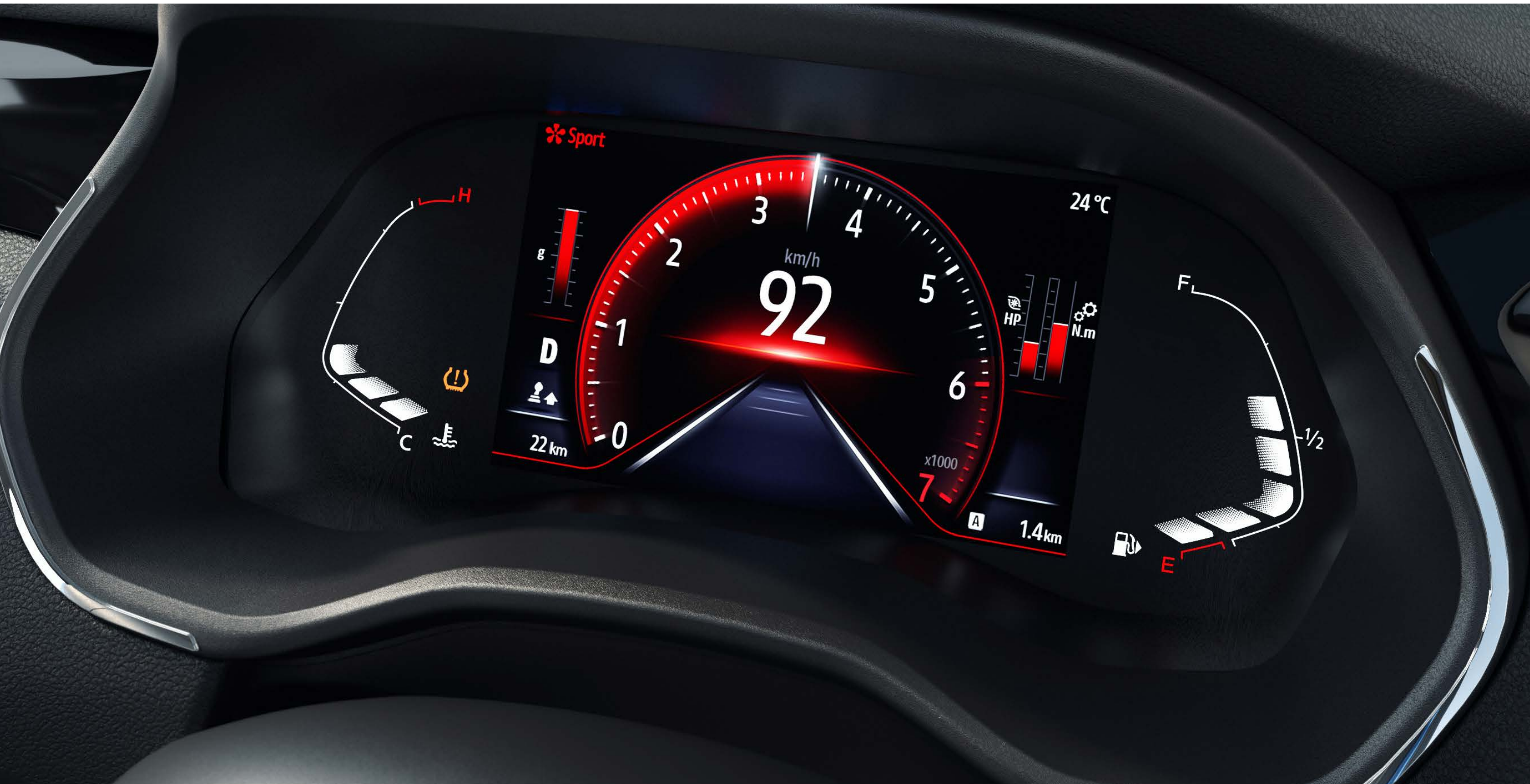
17.78 cm reconfigurable TFT cluster

Experience a host of responsive features, fit for a bold SUV. With a turbo-charged petrol engine under the hood, Kiger truly combines the best of performance and efficiency.