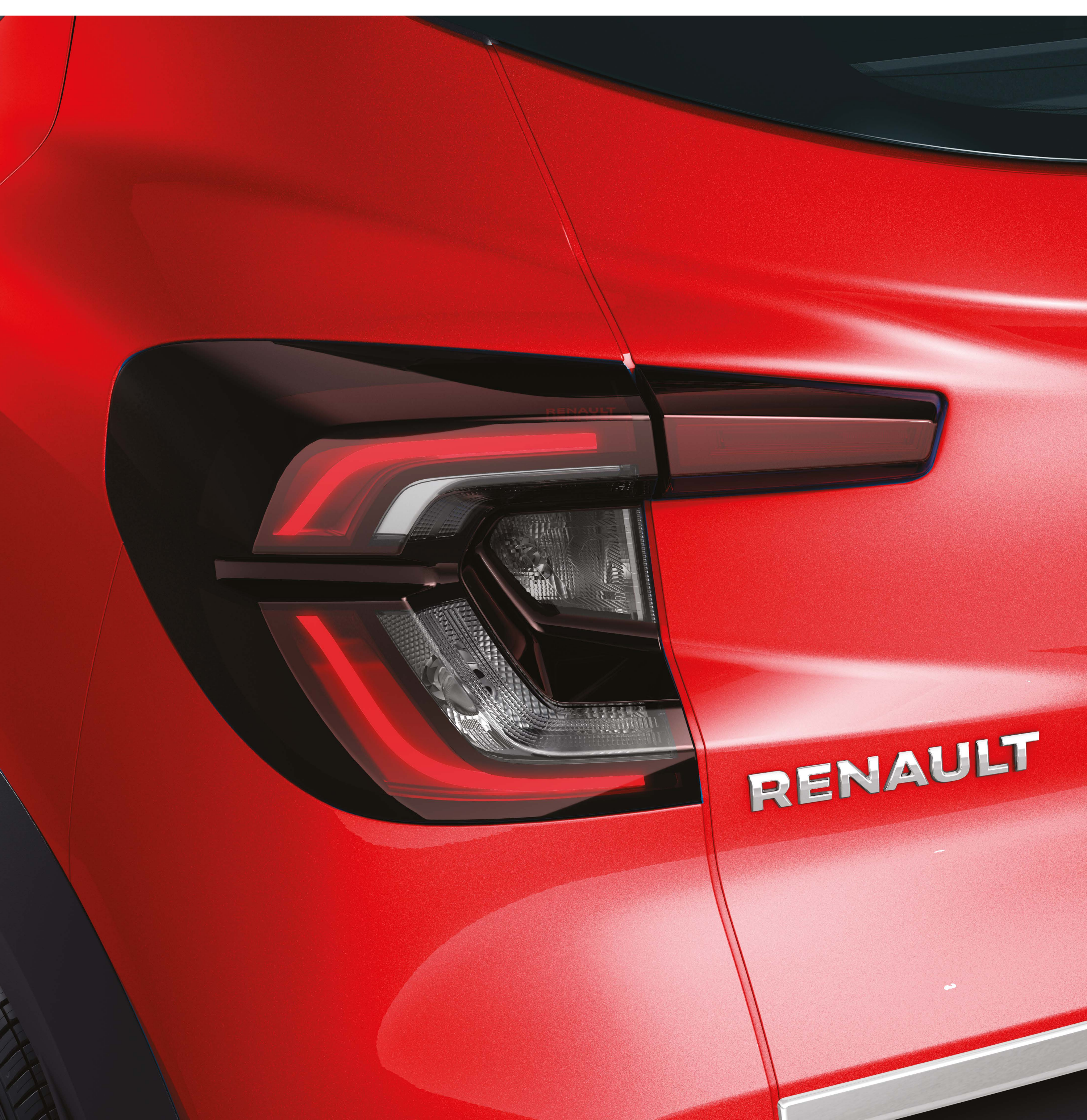
LED tail lamps

You're bound to be in the spotlight when you drive a head-turner like Kiger. The signature lighting, high ground clearance, and exciting dual tone finish all work together to create an imposing appearance.