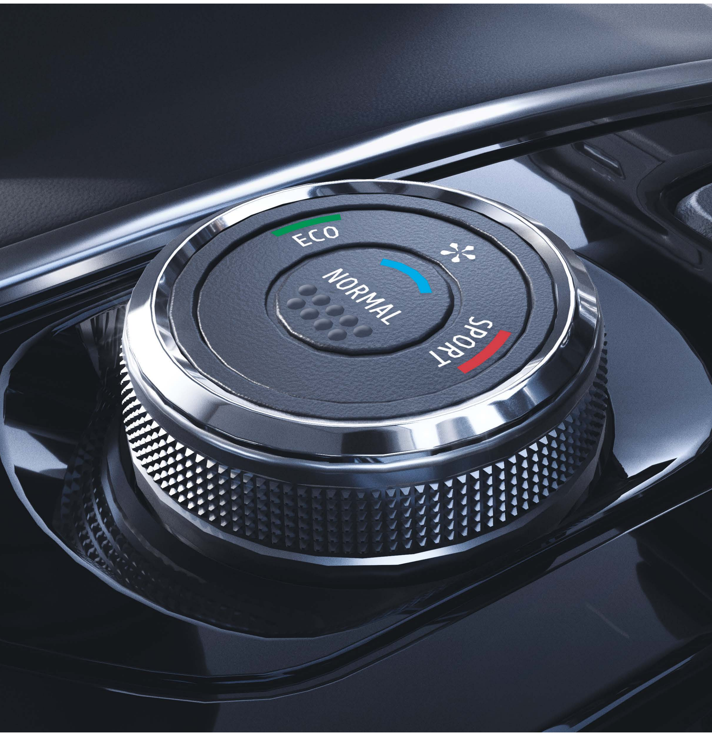
multi-sense drive modes

Take charge as you zip through paved city roads and rough terrains alike. Switch to eco mode for a relaxed, fuel-efficient drive, or go all out on speed and agility with sport mode.