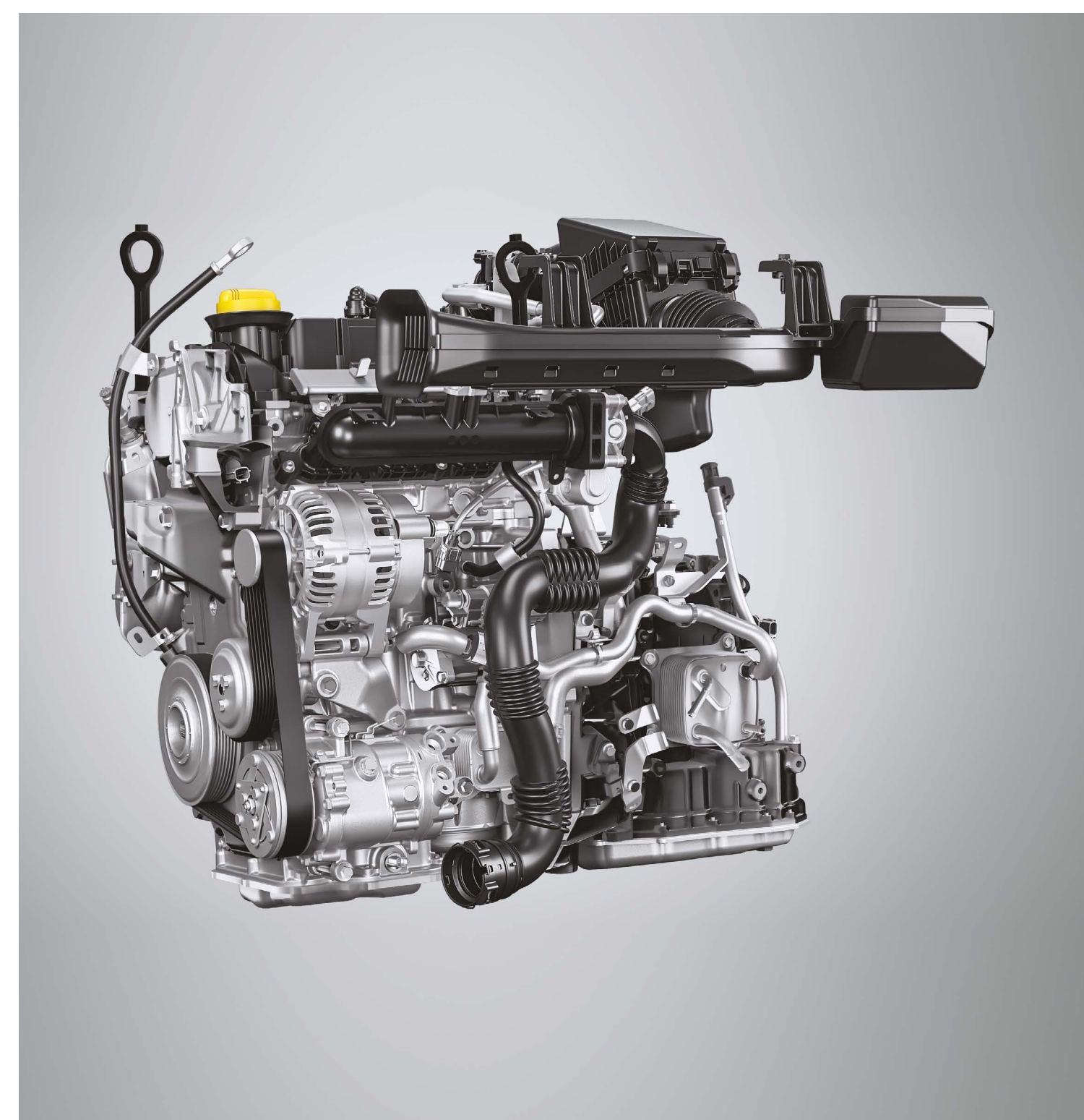
1.0L turbo-charged engine