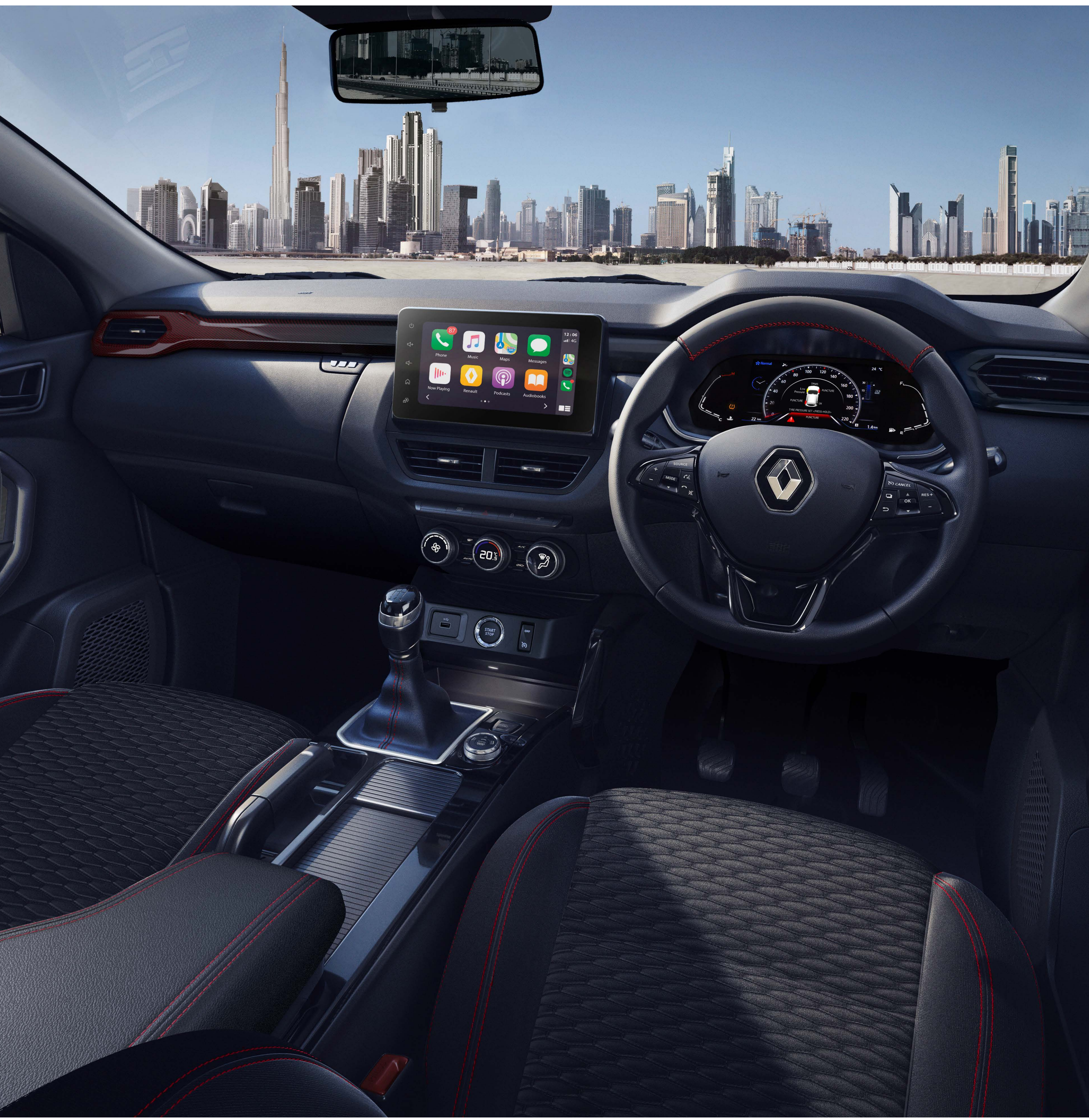
spacious modern interiors

If the exteriors had you floored, wait till you get inside. Enter a world of pure class and intelligence that will keep surprising you the more you explore it.