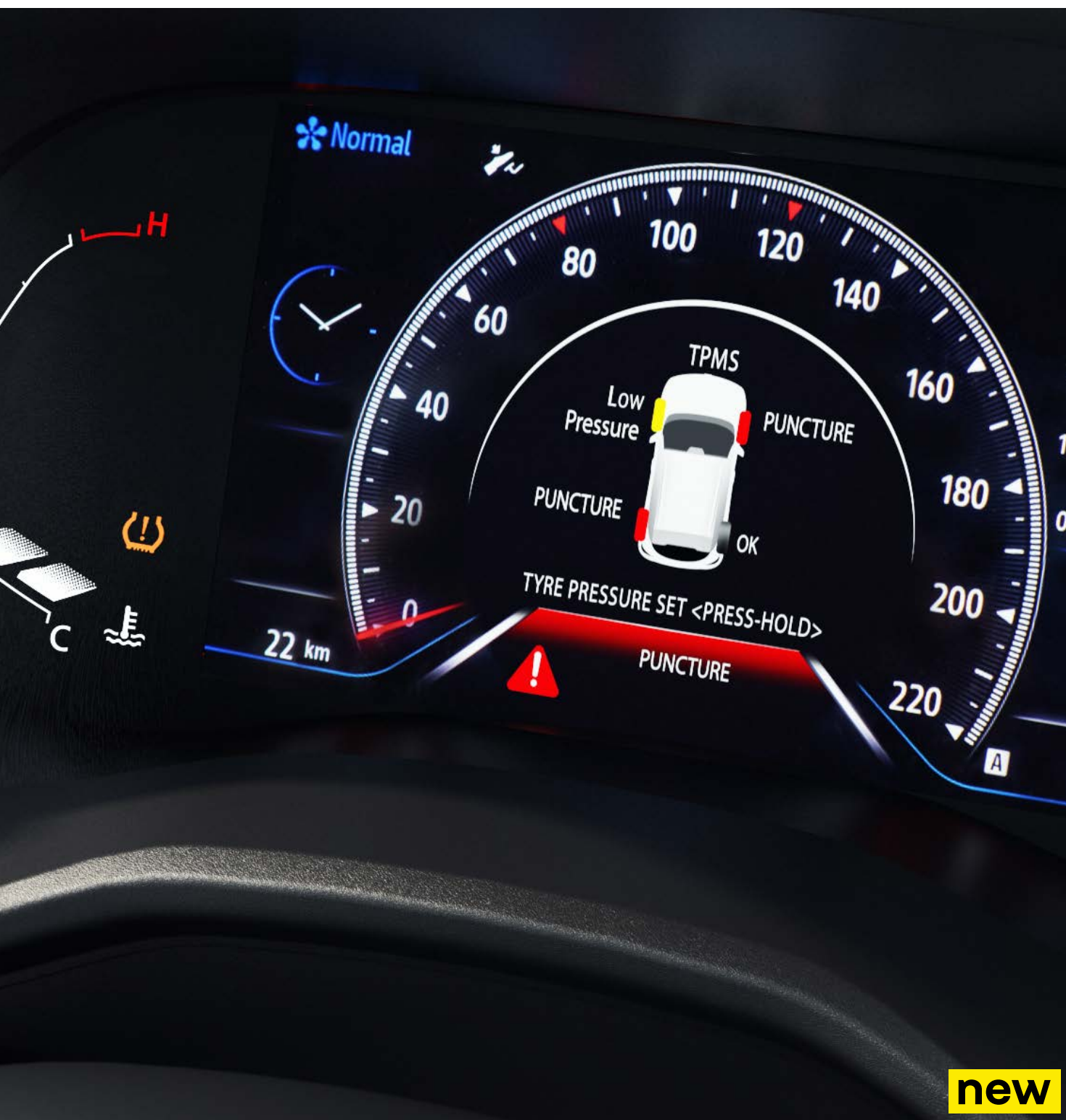
tyre pressure monitoring system