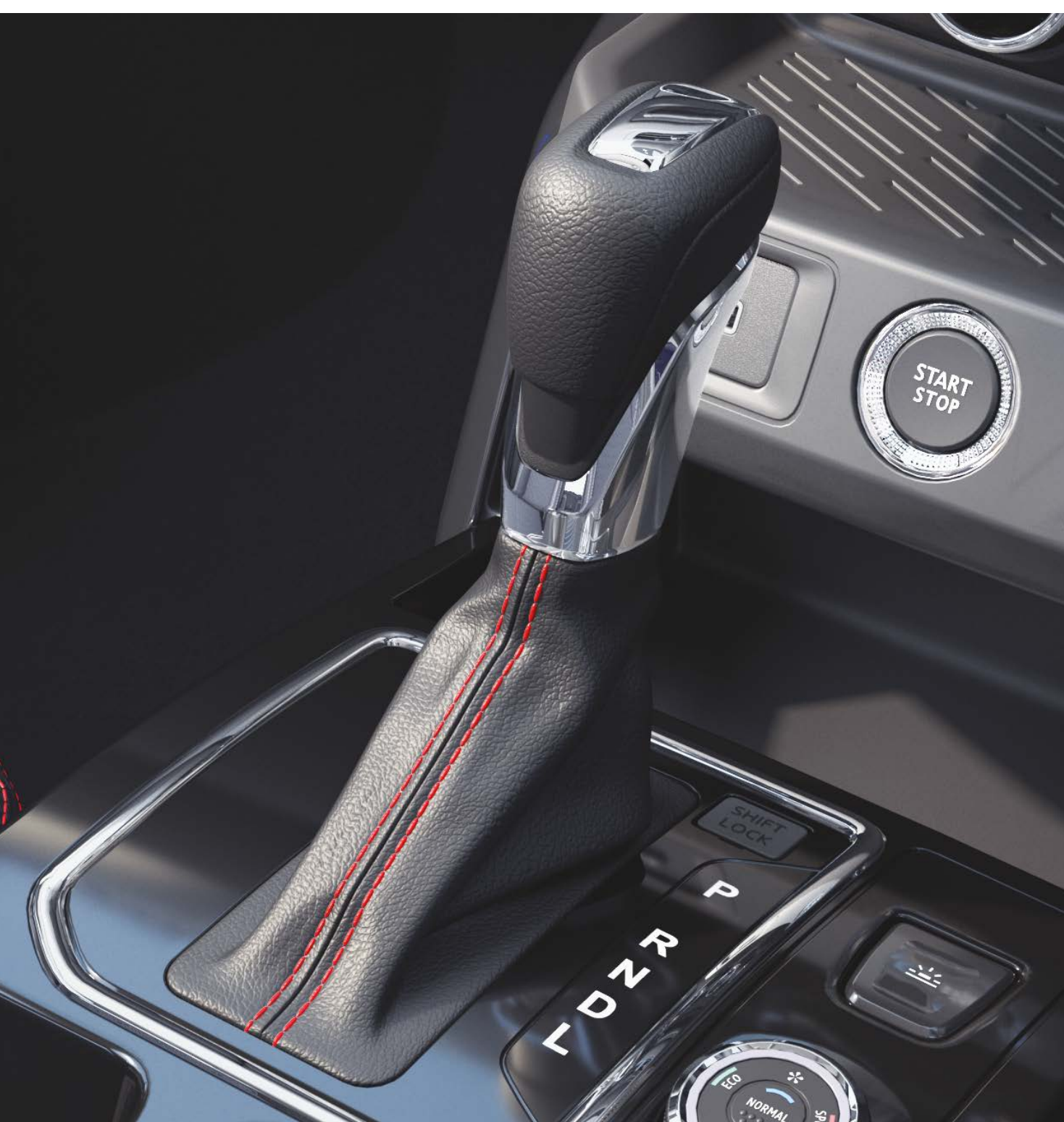
x-tronic CVT transmission