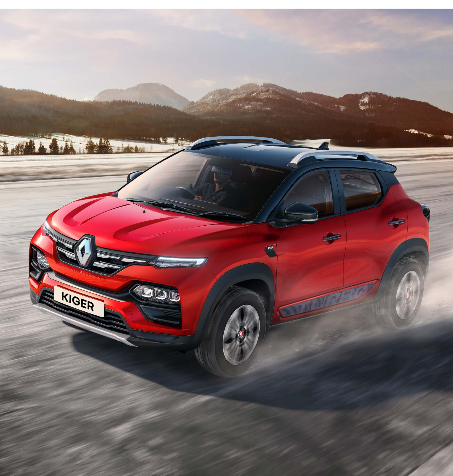
front skid plate

The finest details like the chrome front grille, rear spoiler, tailgate chrome insert, shark fin antenna, and mystery black door handles reflect the SUV's well-thought-out design philosophy.