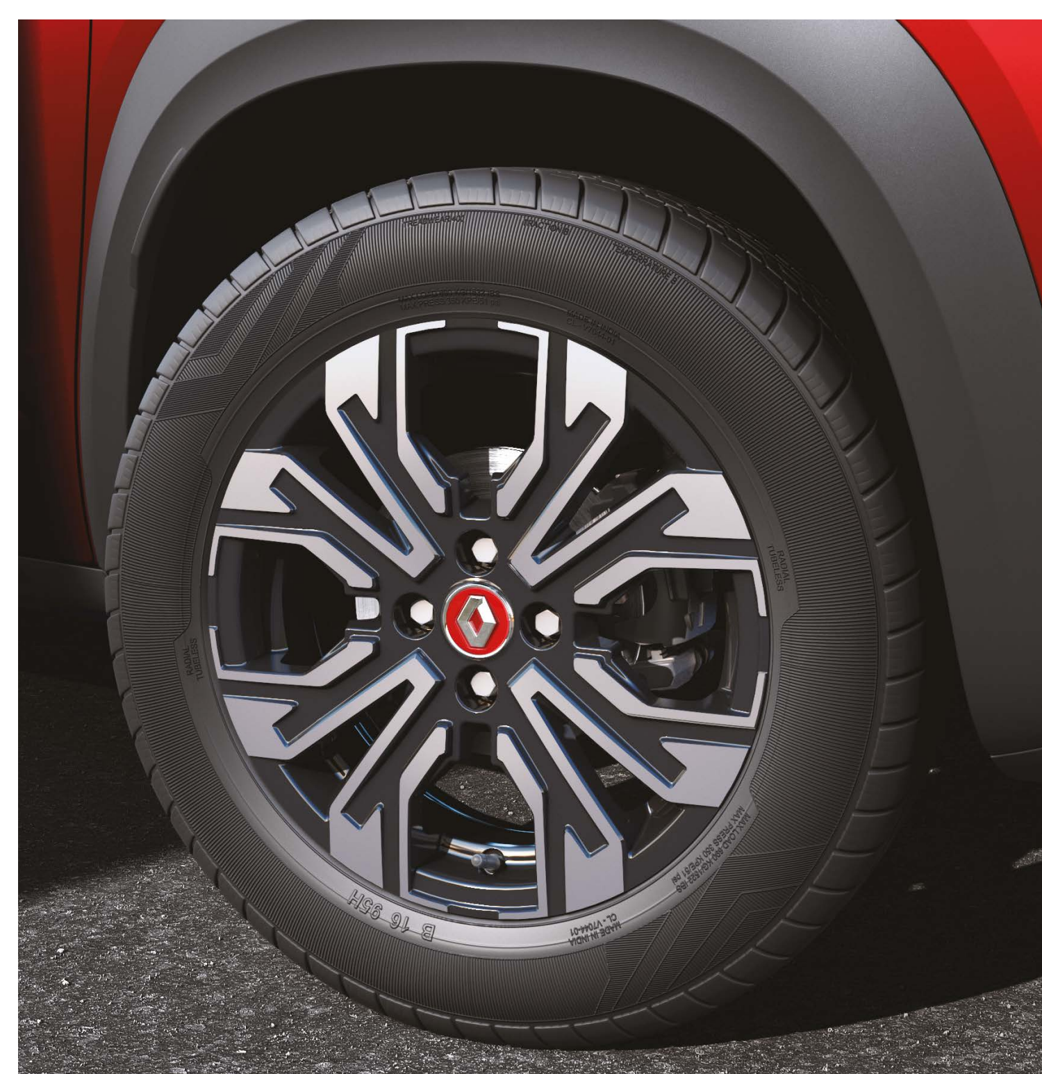
40.64 cm diamond cut alloys