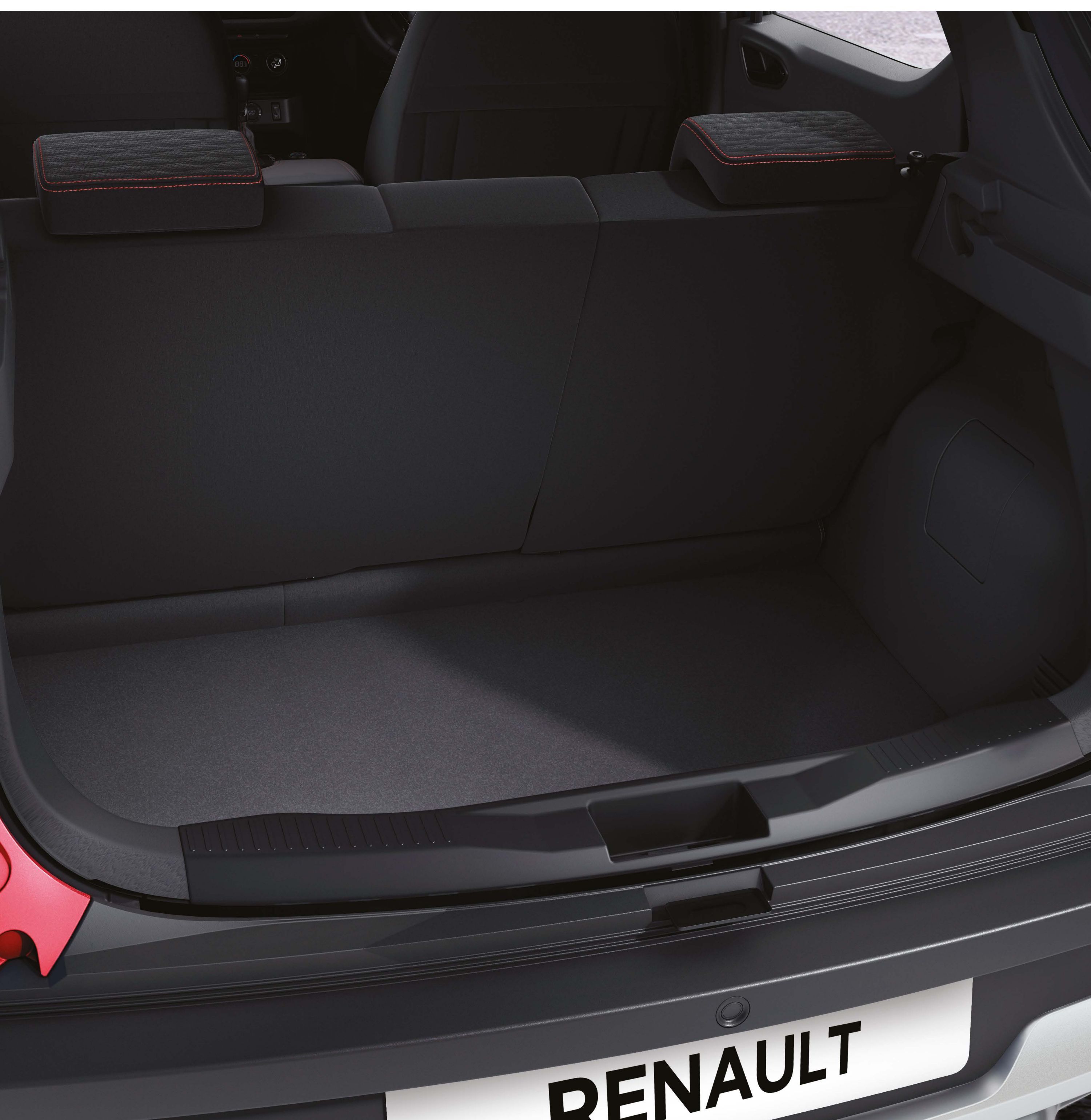
cargo space of 405 litres

Right from its ergonomic seating, high interior storage to its spacious cabin, everything about Kiger spells comfort. So sit comfortably and enjoy every long drive.