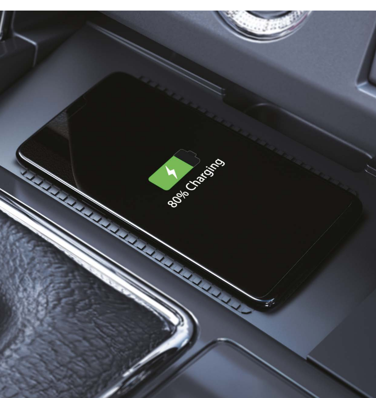
wireless smartphone charger

Its smart technology extends to the start/stop button, smart access card, rear view camera, and auto AC with clean air filter.