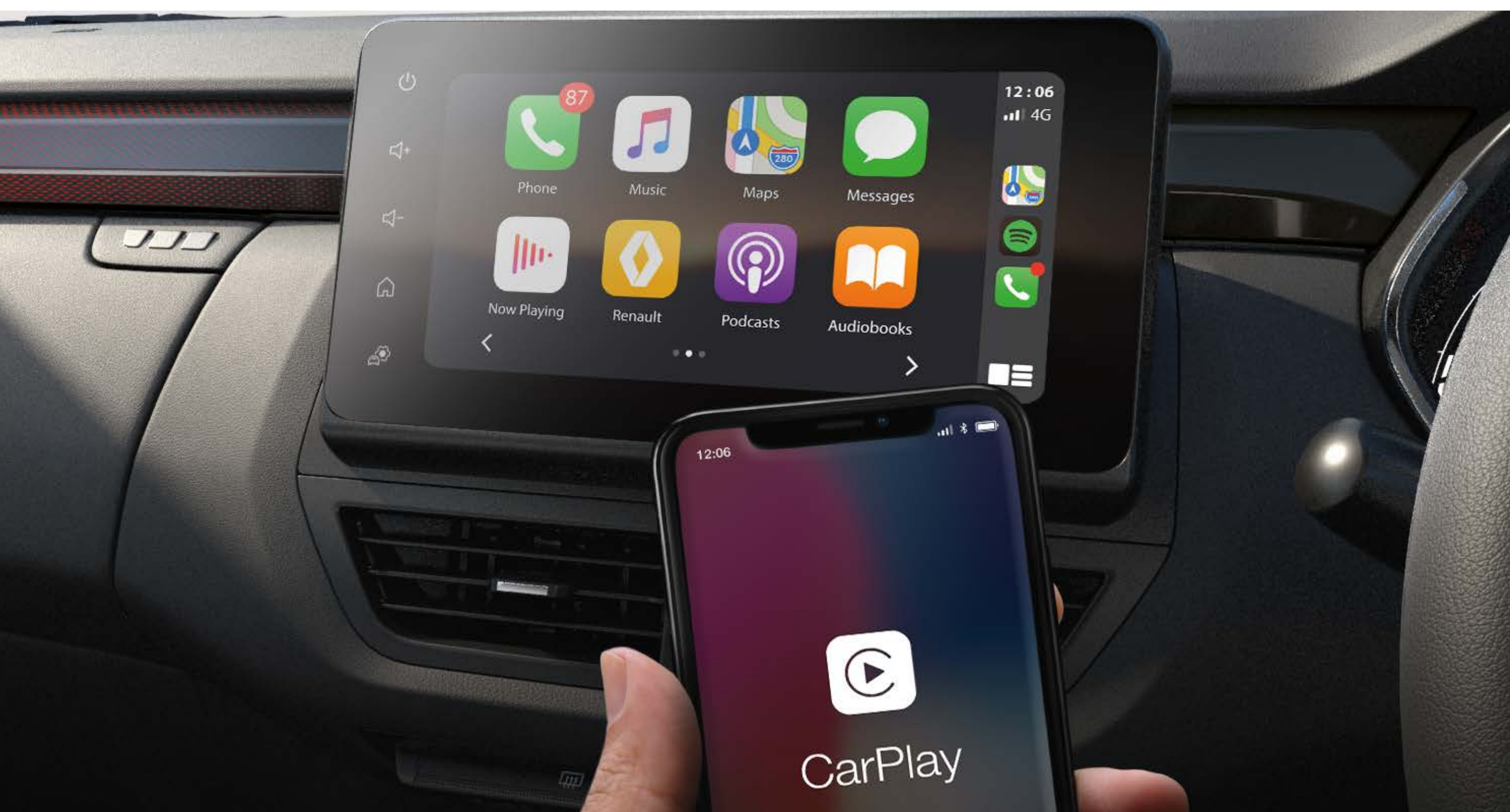
wireless smartphone replication

Connect to an intuitive entertainment experience via wireless smartphone replication and an immersive ARKAMYS® sound system. Its smart technology extends to the start/stop button, smart access card, rear view camera, and auto AC with PM2.5 clean air filter.