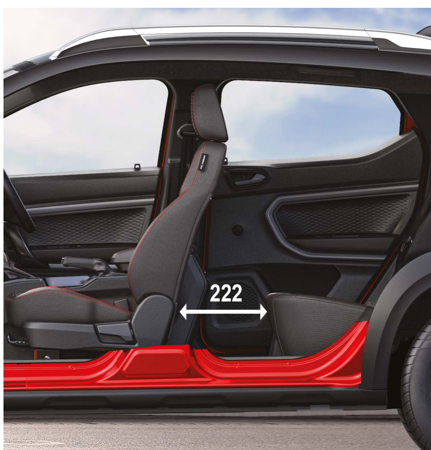
rear knee room of 222 mm