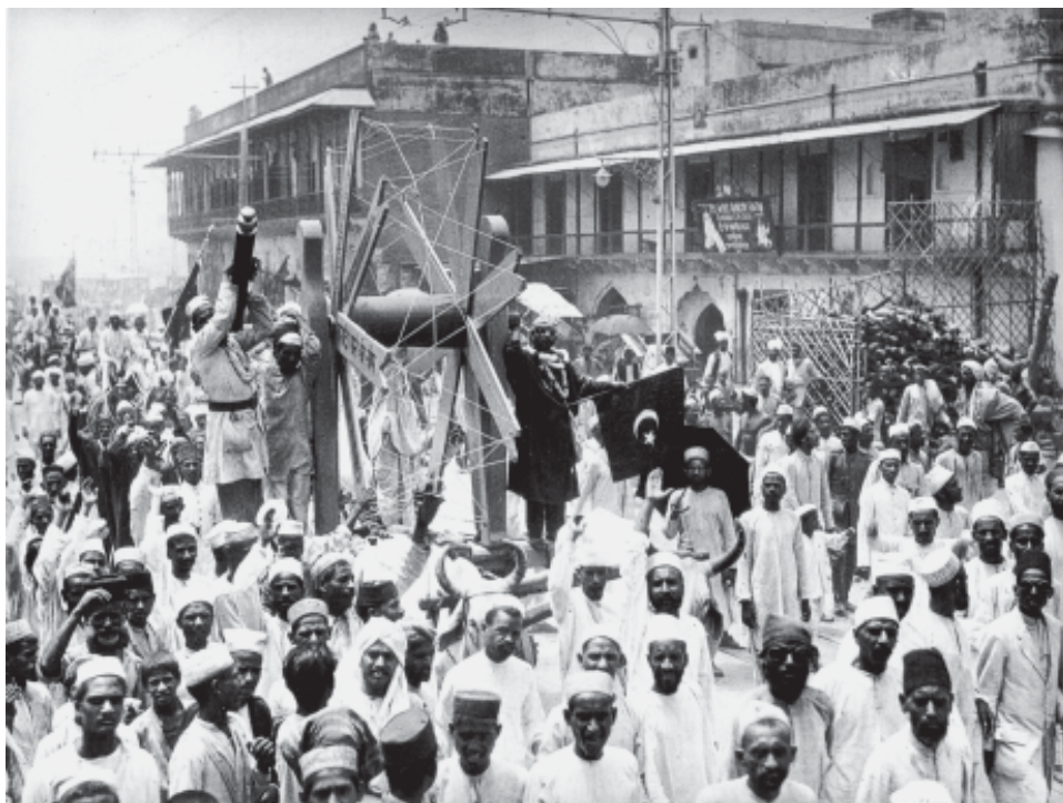
Fig. 4 – The boycott of foreign cloth, July 1922. Foreign cloth was seen as the symbol of Western economic and cultural domination.

Boycott – The refusal to deal and associate with people, or participate in activities, or buy and use things; usually a form of protest