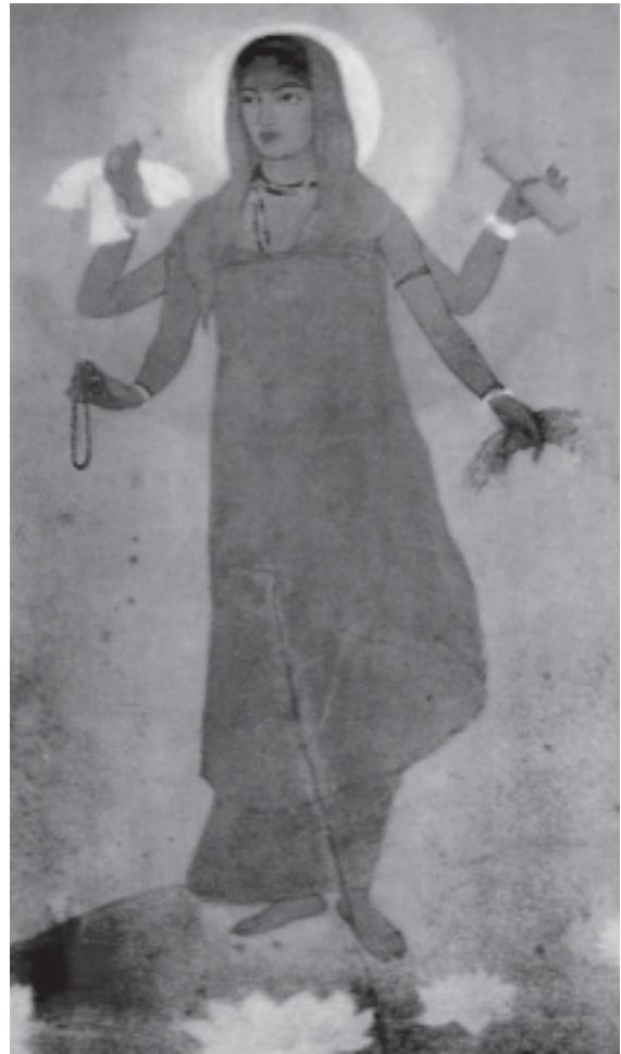
Fig. 12 – Bharat Mata, Abanindranath Tagore, 1905.

Ideas of nationalism also developed through a movement to revive Indian folklore. In late-nineteenth-century India, nationalists began recording folk tales sung by bards and they toured villages to gather folk songs and legends. These tales, they believed, gave a true picture of traditional culture that had been corrupted and damaged by outside forces. It was essential to preserve this folk tradition in order to discover one’s national identity and restore a sense of pride in one’s past. In Bengal, Rabindranath Tagore himself began collecting ballads, nursery rhymes and myths, and led the movement for folk