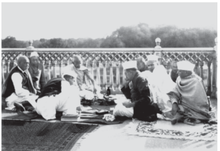
Fig. 6 – Meeting of Congress leaders at Allahabad, 1931. Apart from Mahatma Gandhi, you can see Sardar Vallabhbhai Patel (extreme left), Jawaharlal Nehru (extreme right) and Subhas Chandra Bose (fifth from right).

When the Simon Commission arrived in India in 1928, it was greeted with the slogan 'Go back Simon'. All parties, including the Congress and the Muslim League, participated in the demonstrations. In an effort to win them over, the viceroy, Lord Irwin, announced in October 1929, a vague offer of 'dominion status' for India in an unspecified future, and a Round Table Conference to discuss a future constitution. This did not satisfy the Congress leaders. The radicals within the Congress, led by