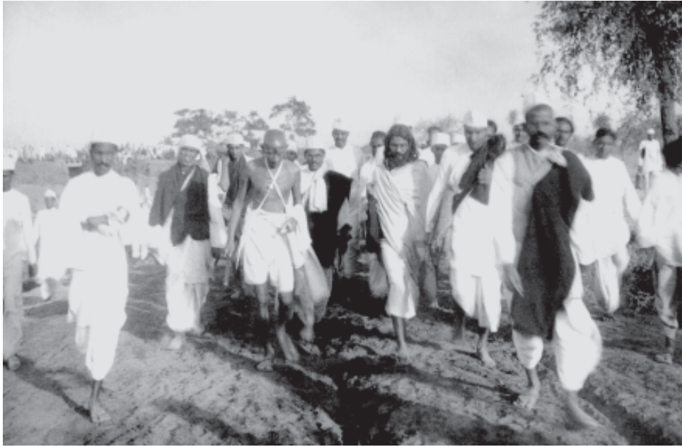
Fig. 7 – The Dandi march. During the salt march Mahatma Gandhi was accompanied by 78 volunteers. On the way they were joined by thousands.

with the British, as they had done in 1921-22, but also to break colonial laws. Thousands in different parts of the country broke the salt law, manufactured salt and demonstrated in front of government salt factories. As the movement spread, foreign cloth was boycotted, and liquor shops were picketed. Peasants refused to pay revenue and chaukidari taxes, village officials resigned, and in many places forest people violated forest laws – going into Reserved Forests to collect wood and graze cattle.