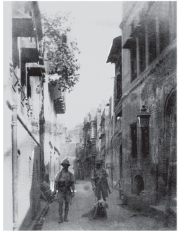
Fig. 3 – General Dyer's 'crawling orders' being administered by British soldiers, Amritsar, Punjab, 1919.

In his famous book Hind Swaraj (1909) Mahatma Gandhi declared that British rule was established in India with the cooperation of