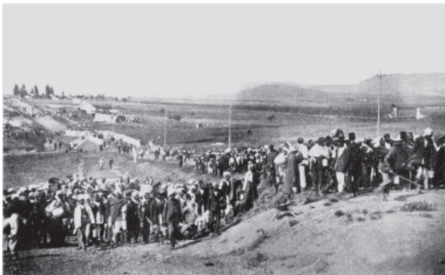
Fig. 2 – Indian workers in South Africa march through Volksrust, 6 November 1913. Mahatma Gandhi was leading the workers from Newcastle to Transvaal. When the marchers were stopped and Gandhiji arrested, thousands of more workers joined the satyagraha against racist laws that denied rights to non-whites.

Mahatma Gandhi returned to India in January 1915. As you know, he had come from South Africa where he had successfully fought