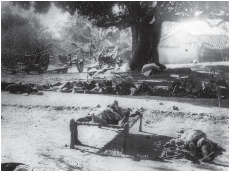
Fig. 5 – Chauri Chaura, 1922.

The visions of these movements were not defined by the Congress programme. They interpreted the term swaraj in their own ways, imagining it to be a time when all suffering and all troubles would be over. Yet, when the tribals chanted Gandhiji's name and raised slogans demanding 'Swatantra Bharat', they were also emotionally relating to an all-India agitation. When they acted in the name of Mahatma Gandhi, or linked their movement to that of the Congress, they were identifying with a movement which went beyond the limits of their immediate locality.