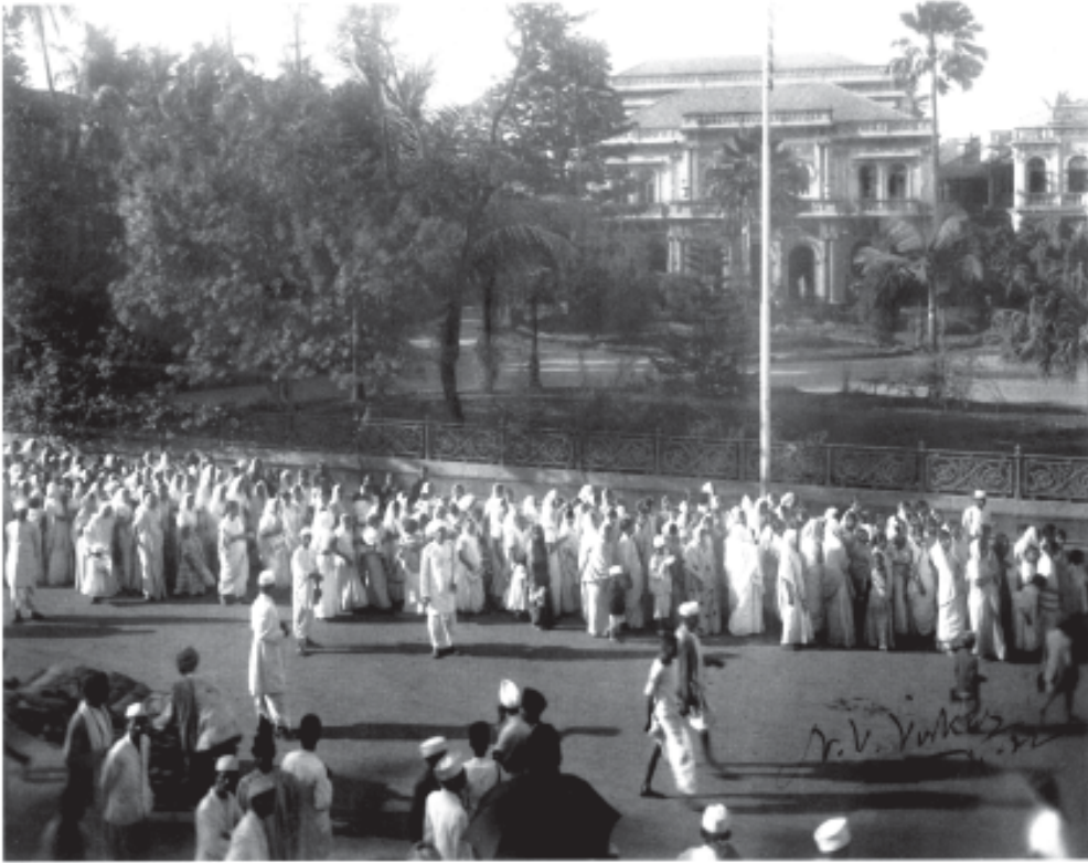
Fig. 9 – Women join nationalist processions. During the national movement, many women, for the first time in their lives, moved out of their homes on to a public arena. Amongst the marchers you can see many old women, and mothers with children in their arms.

picketed foreign cloth and liquor shops. Many went to jail. In urban areas these women were from high-caste families; in rural areas they came from rich peasant households. Moved by Gandhiji's call, they began to see service to the nation as a sacred duty of women. Yet, this increased public role did not necessarily mean any radical change in the way the position of women was visualised. Gandhiji was convinced that it was the duty of women to look after home and hearth, be good mothers and good wives. And for a long time the Congress was reluctant to allow women to hold any position of authority within the organisation. It was keen only on their symbolic presence.