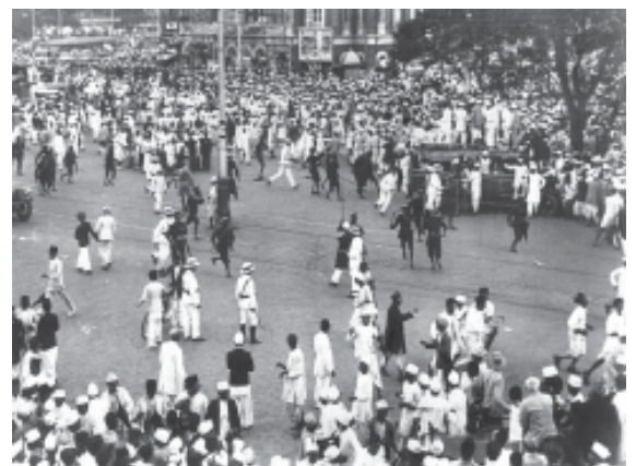
Fig. 8 – Police cracked down on satyagrahis, 1930.

In such a situation, Mahatma Gandhi once again decided to call off the movement and entered into a pact with Irwin on 5 March 1931. By this Gandhi-Irwin Pact, Gandhiji consented to participate in a Round Table Conference (the Congress had boycotted the first