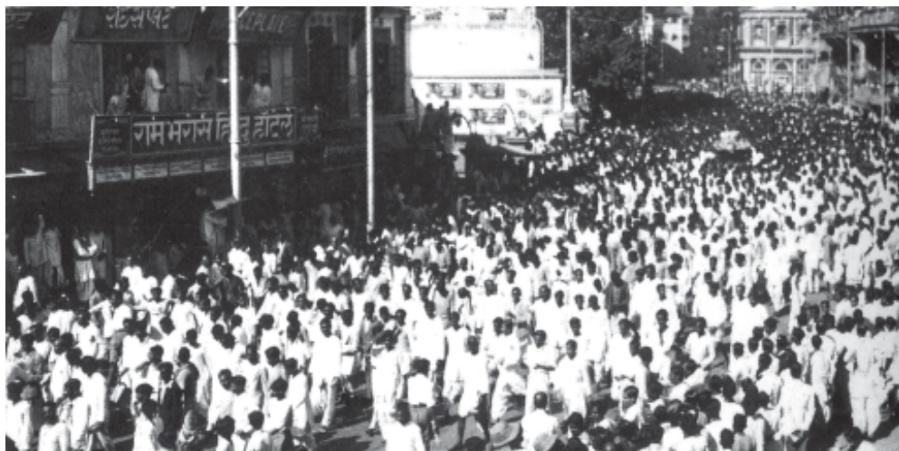
Fig. 1 – 6 April 1919. Mass processions on the streets became a common feature during the national movement.

In an earlier textbook you have read about the growth of nationalism in India up to the first decade of the twentieth century. In this chapter we will pick up the story from the 1920s and study the Non-Cooperation and Civil Disobedience Movements. We will explore how the Congress sought to develop the national movement, how different social groups participated in the movement, and how nationalism captured the imagination of people.