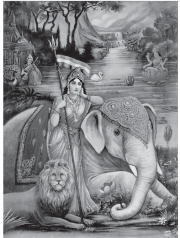
Fig. 14 – Bharat Mata.

This figure of Bharat Mata is a contrast to the one painted by Abanindranath Tagore. Here she is shown with a trishul, standing beside a lion and an elephant – both symbols of power and authority.