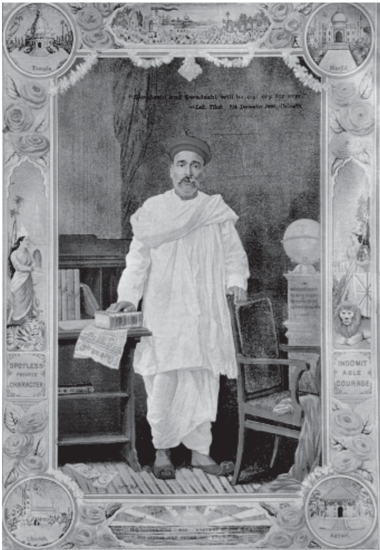
Fig. 11 – Bal Gangadhar Tilak, an early-twentieth-century print. Notice how Tilak is surrounded by symbols of unity. The sacred institutions of different faiths (temple, church, masjid) frame the central figure.

Nationalism spreads when people begin to believe that they are all part of the same nation, when they discover some unity that binds them together. But how did the nation become a reality in the minds of people? How did people belonging to different communities, regions or language groups develop a sense of collective belonging?