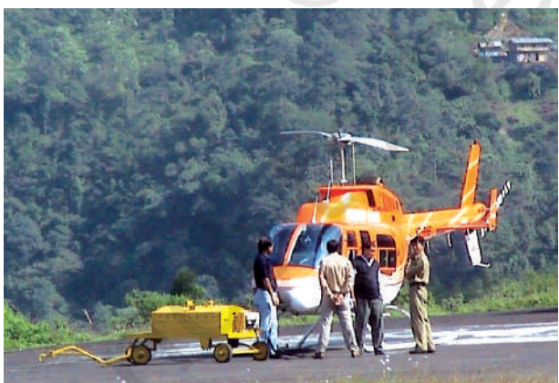
Why is air travel preferred in the north-eastern states?

The air travel, today, is the fastest, most comfortable and prestigious mode of transport. It can cover very difficult terrains