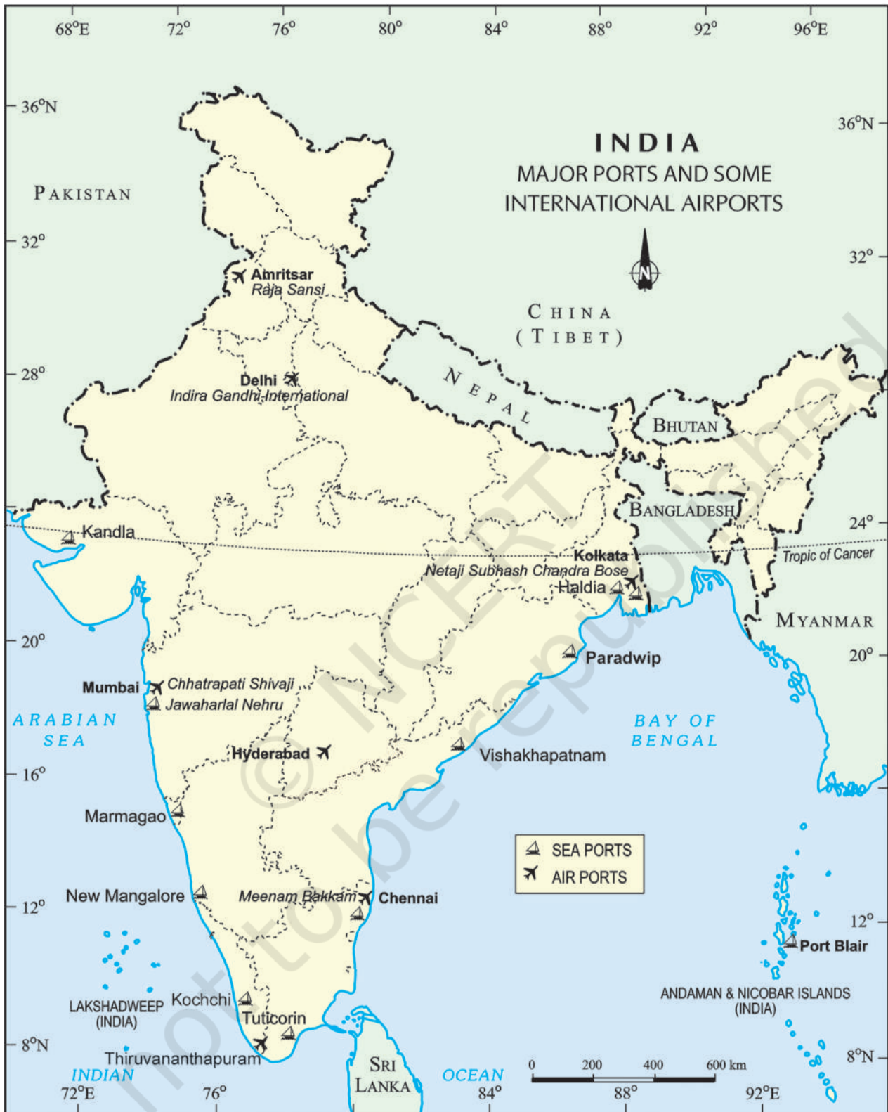
India: Major Ports and Some International Airports