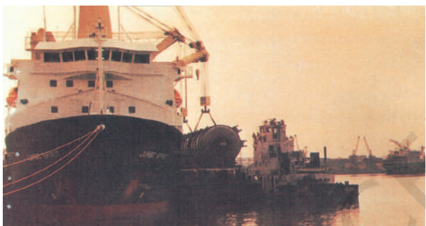
Fig. 7.8: Handling of oversize cargo at Tuticorin port

even our neighbouring countries like Sri Lanka, Maldives, etc. and the coastal regions of India. Chennai is one of the oldest artificial ports of the country. It is ranked next to Mumbai in terms of the volume of trade and cargo. Vishakhapatnam is the deepest landlocked and well-protected port. This port was, originally, conceived as an outlet for iron ore exports. Paradwip port located in Odisha, specialises in the export of iron ore. Kolkata is an inland riverine port. This port serves a very large and rich hinterland of Ganga-Brahmaputra basin. Being a tidal port, it requires constant dredging of Hoogly. Haldia port was developed as a subsidiary port, in order to relieve growing pressure on the Kolkata port.