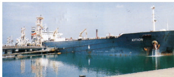
Fig. 7.7: Tanker discharging crude oil at New Mangalore port

Mumbai is the biggest port with a spacious natural and well-sheltered harbour. The Jawaharlal Nehru port was planned with a view to decongest the Mumbai port and serve as a hub port for this region. Marmagao port (Goa) is the premier iron ore exporting port of the country. This port accounts for about fifty per cent of India's iron ore export. New Mangalore port, located in Karnataka caters to the export of iron ore concentrates from Kudremukh mines. Kochchi is the extreme south-western port, located at the entrance of a lagoon with a natural harbour.