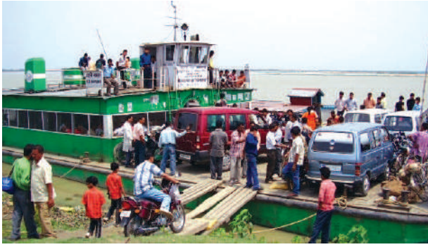
Fig. 7.5: Inland waterways widely used in north-eastern states