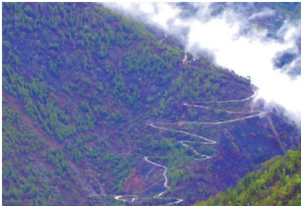
Fig. 7.3: Hilly Tracts