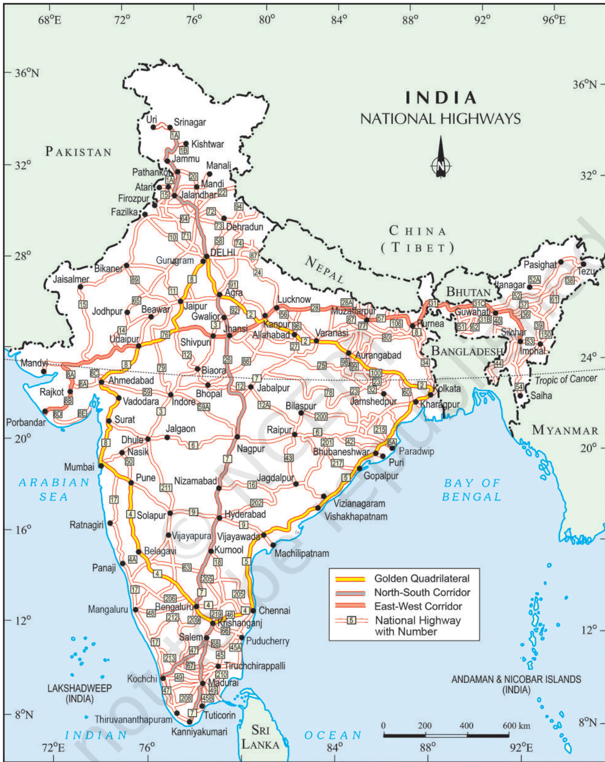
India: National Highways