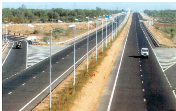
Fig.7.2: Ahmedabad- Vadodara Expressway