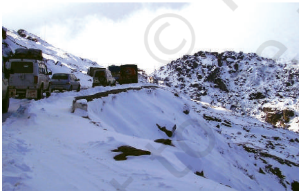
Fig. 7.4: Traffic on north-eastern border road (Arunachal Pradesh)

Roads can also be classified on the basis of the type of material used for their construction such as metalled and unmetalled roads. Metalled roads may be made of cement, concrete or even bitumen of coal, therefore,