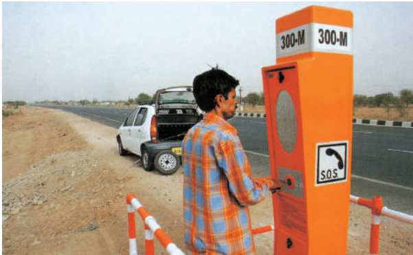
Fig.7.10 : Emergency call box on NH-8

Digital India is an umbrella programme to prepare India for a knowledge based transformation. The focus of Digital India Programme is on being transformative to realise – IT (Indian Talent) + IT (Information Technology)=IT (India Tomorrow) and is on making technology central to enabling change.