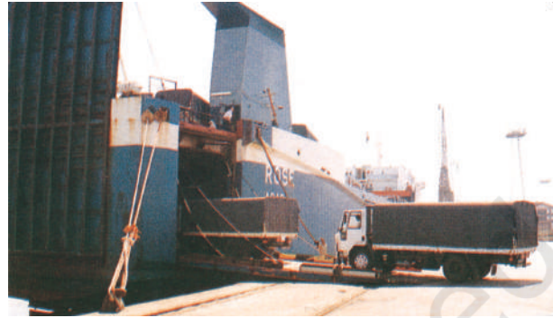
Fig. 7.6: Trucks being driven into the vessel at Mumbai port

Deendayal Port, is a tidal port. It caters to the convenient handling of exports and imports of highly productive granary and industrial belt stretching across UT of Jammu and Kashmir, and the states of Himachal Pradesh, Punjab, Haryana, Rajasthan and Gujarat.